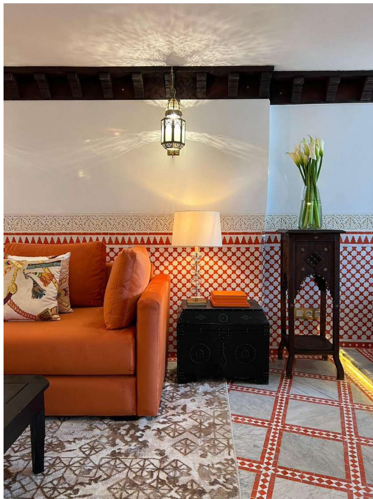
📷 Mayssa Suite with Medina View